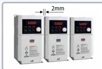
Side-by-side Installation (2mm between drives)