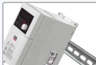
DIN rail Mountable