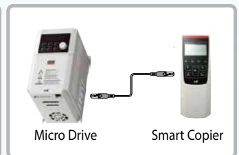
Smart Copier (Parameter copy without power)