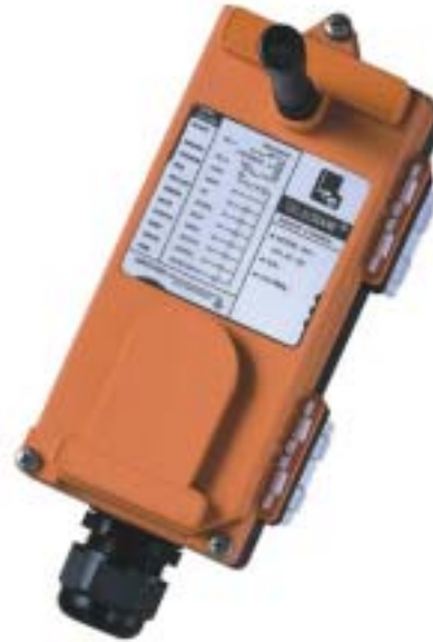
(2)Receiver, one unit.