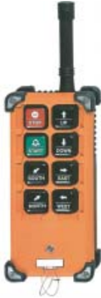
(1)Transmitter, one unit.

When you get a standard and full set of F21-E1 system, it includes the following item.: